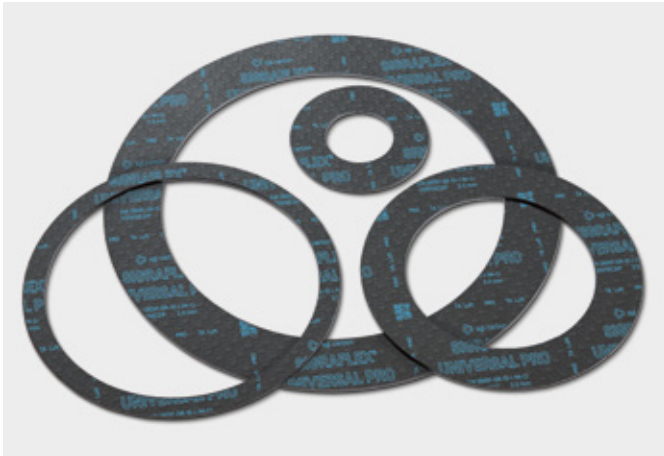
↑ Gaskets made from SIGRAFLEX UNIVERSAL PRO