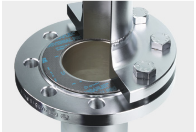
↑ Flange with SIGRAFLEX UNIVERSAL PRO gasket